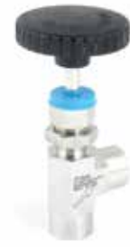
Angle Pattern Needle Valve with Female Fittings