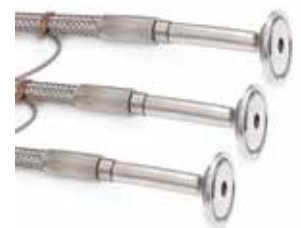
TC End Connection