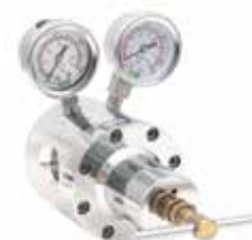
Regulator with Inlet & Outlet Pressure Gauge