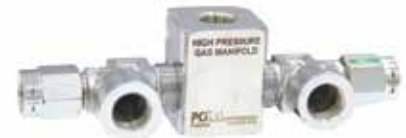
Gas Manifold for Two Cylinder