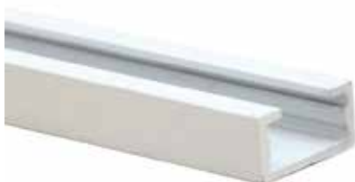
Aluminium Profile (Powder Coated)