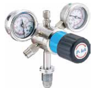
NGSS Series Single Stage Cylinder Regulator

The NGSH Series is a Double Stage Regulator used for liquified gases. Inlet cylinder Pressure 150 Bar & Outlet Pressure 10 Bar.