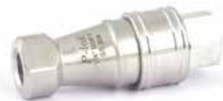
QRC (Complete Assembly)