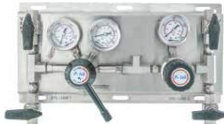
Semi Automatic Changeover without Outlet Regulator