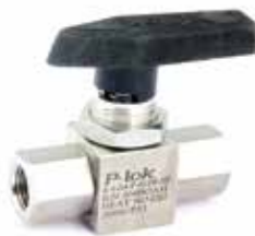
Ball Valve with Female Fittings