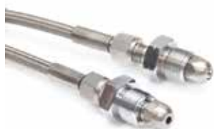
BSPM End Connection

P-Lok manufactures varieties of flexible hose which are specially designed for cylinder, Autoclave and for high and low pressure application. It comes with Complete SS 316/SS316L /Thermoplast and PTFE internal with SS 304 / SS 316 / SS 316L outer braiding. It comes with Tube fittings, BSP Male / Female, Triclono fitting and with nut bull nose as per cylinder requirement. The hoses comes with safety roap which ensure better safety.