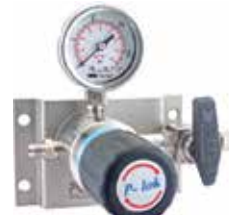
Regulator with Outlet Pressure Gauge & Ball Valve