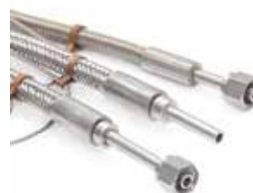
Tube End Connection