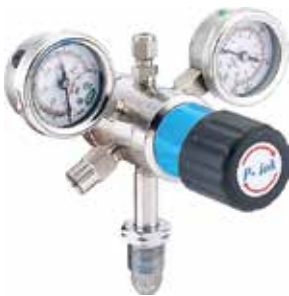
NGS Series Double Stage Cylinder Regulator

The NGS Series is a Double Stage Regulator used for Inert & Flammable gases. Inlet cylinder Pressure 150 Bar & Outlet Pressure 10 Bar.