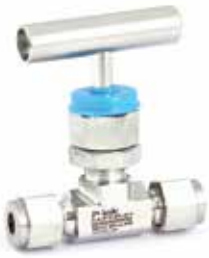
Needle Valve with Tube Fittings