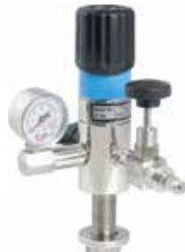
Regulator with Outlet Pressure Gauge, Needle Valve & Shut Off Valve