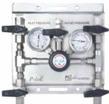
Manual Changeover Panel for Two Cylinder