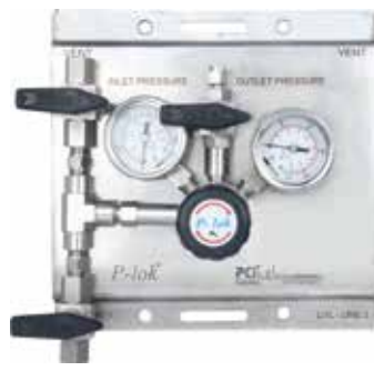
Manual Changeover Panel for Single Cylinder