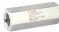
CHECK VALVE BSP / NPT (Female End)