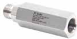
CHECK VALVE BSP / NPT (Male / Female End)