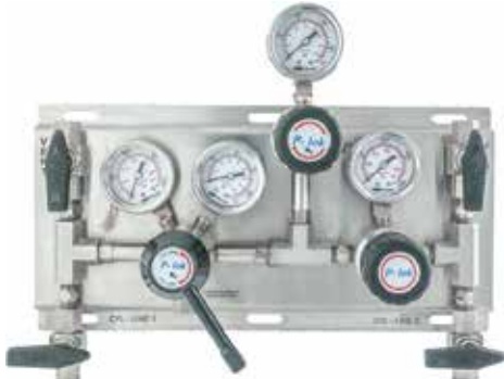
Semi Automatic Changeover

Description : The Semi-Automatic gas change over helps to do the changeover of one cylinder bank to another cylinder bank, This is done with the help of two pre-set regulator with differential pressure on both the side Pressure decrease in the active cylinder below the set level cause change over to full cylinder. The Liver moving towards the full cylinder bank helps of the disconnection and changeover of empty cylinder bank with the gas flow without interruption. The contact gauge or pressure transmitter used in the Auto gas changeover with low gas alarm panel helps to facilitate the alarm as per the pressure set on contact gauge or pressure transmitter.