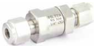
MICRON FILTER (Inline Type)