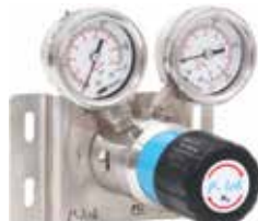
Regulator with Inlet & Outlet Pressure Gauge