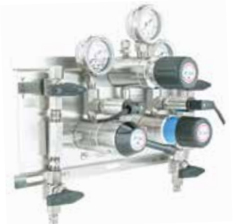
Semi Automatic Changeover with Pressure Transmitter