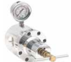
Regulator with Outlet Pressure Gauge