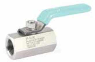
Ball Valve with Female Fittings