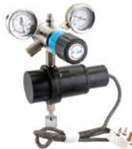
NGSH Series Double Stage Cylinder Regulator with Pre Heater

The NGS Series is a Double Stage Regulator used for Inert & Flammable gases. Inlet cylinder Pressure 150 Bar & Outlet Pressure 10 Bar.