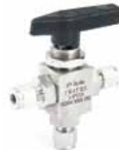
Three Way Ball Valve with Tube Fittings