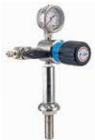
Regulator with Outlet Pressure Gauge & Ball Valve