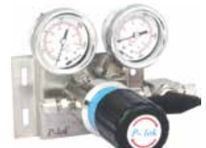
Regulator with Inlet & Outlet Pressure Gauge & Ball Valve