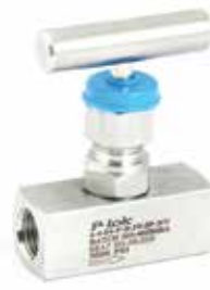
Needle Valve with Female Fittings