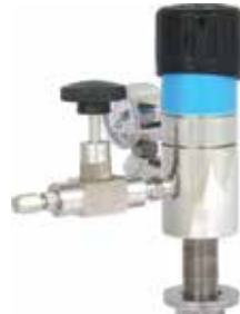
Regulator with Outlet Pressure Gauge, Needle Valve