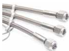
BSPF End Connection