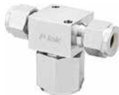
MICRON FILTER (TEE Type)