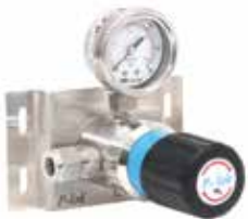
Regulator with Outlet Pressure Gauge

The Point of Use regulator is a single stage regulator consist of inlet/outlet pressure gauge, Ball Valve, Safety relief valve (as per requirement).