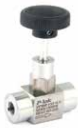
Needle Valve with Female Fittings