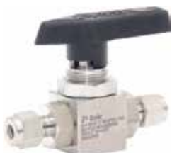
Ball Valve with Tube Fittings